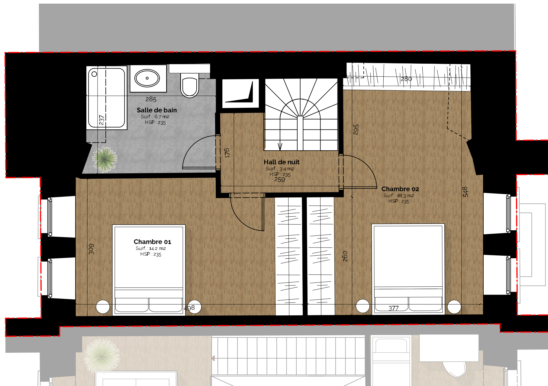
App.01 - R+1